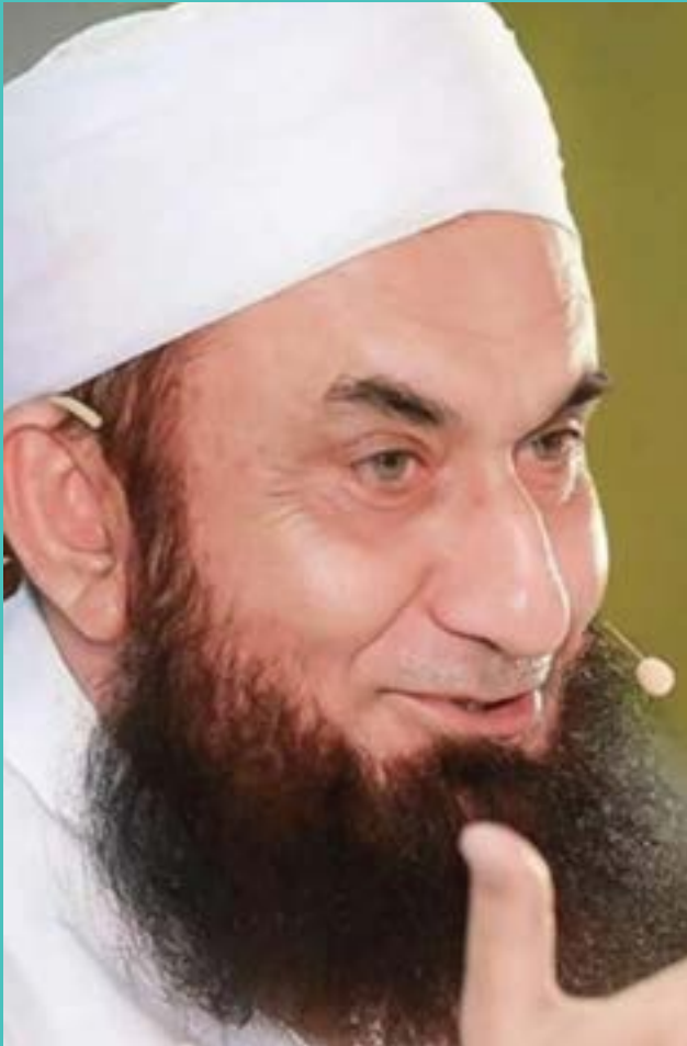
Maulana Tariq Jameel